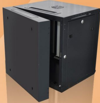
SWA2 Wall Rack Size of Standard Model - W600MM SWA2 系列規格表-寬600MM