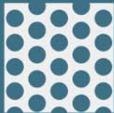
| Standard vent door

WD series rack cabinet are accordance with ANSI/EIA RS 310-C/D and certified by UL, CE, MIL-STD-167 vibration test, MIL-STD-810F and SGS pressing certified that can bear loads above 1500 KGW, another has passed ISO 9001. We can provide the best products and service quality.