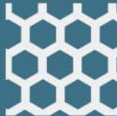
| Customize honeycomb vent door