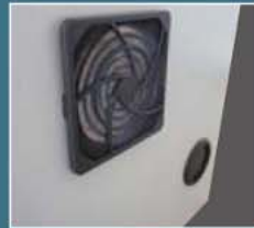
Install filter on left and right side to catch the air flow