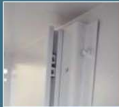
Adjustable aluminum mount post