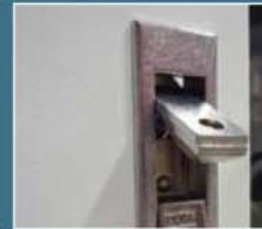
Hidden handle lock